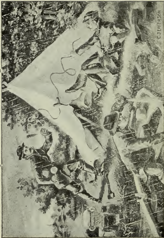
Three Men in a Boat.